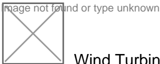
Wind Turbines at Avonmouth Dock

We invest to look after our environment across the 2,600 acres of the Port estate as well as looking after the marine environment