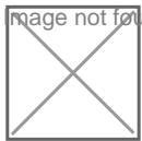
Animal feed storage at Portbury