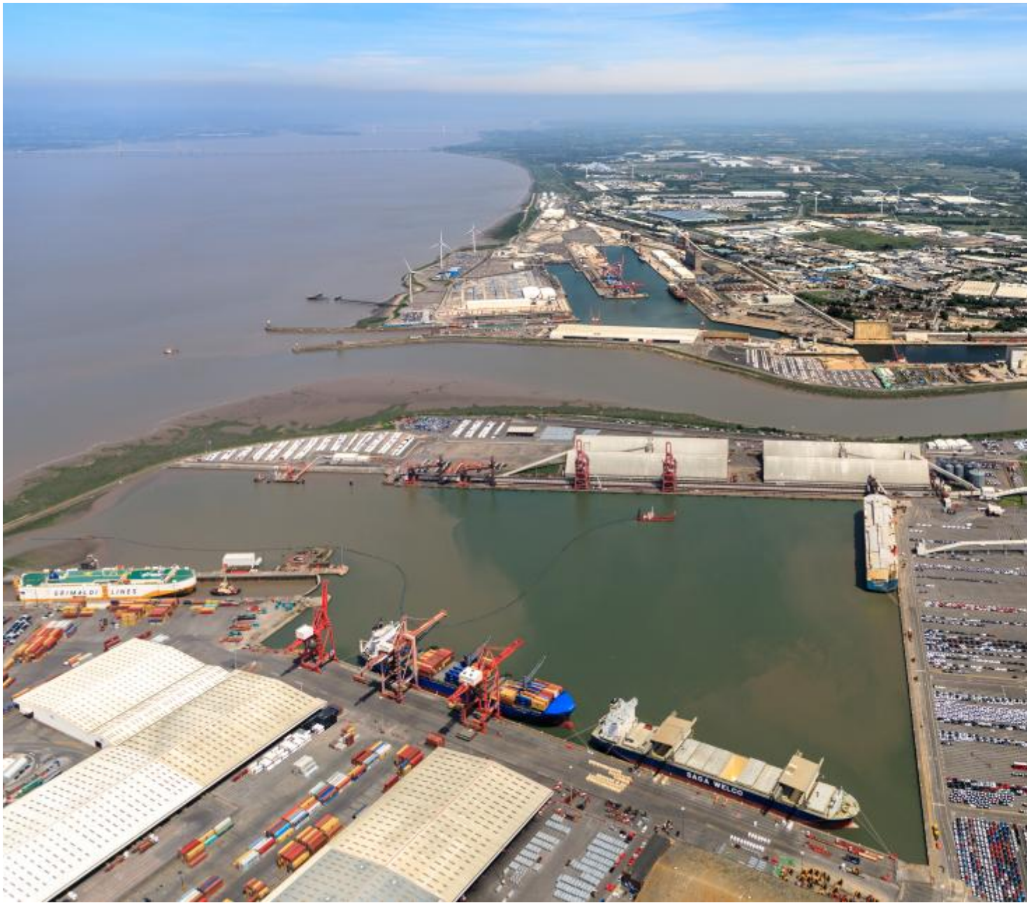
Bristol Port estate spans 2,600 acres

The reason for choosing Bristol Port is simple - Bristol Port offers the most cost effective end-to-end logistics solution of any UK deep sea port