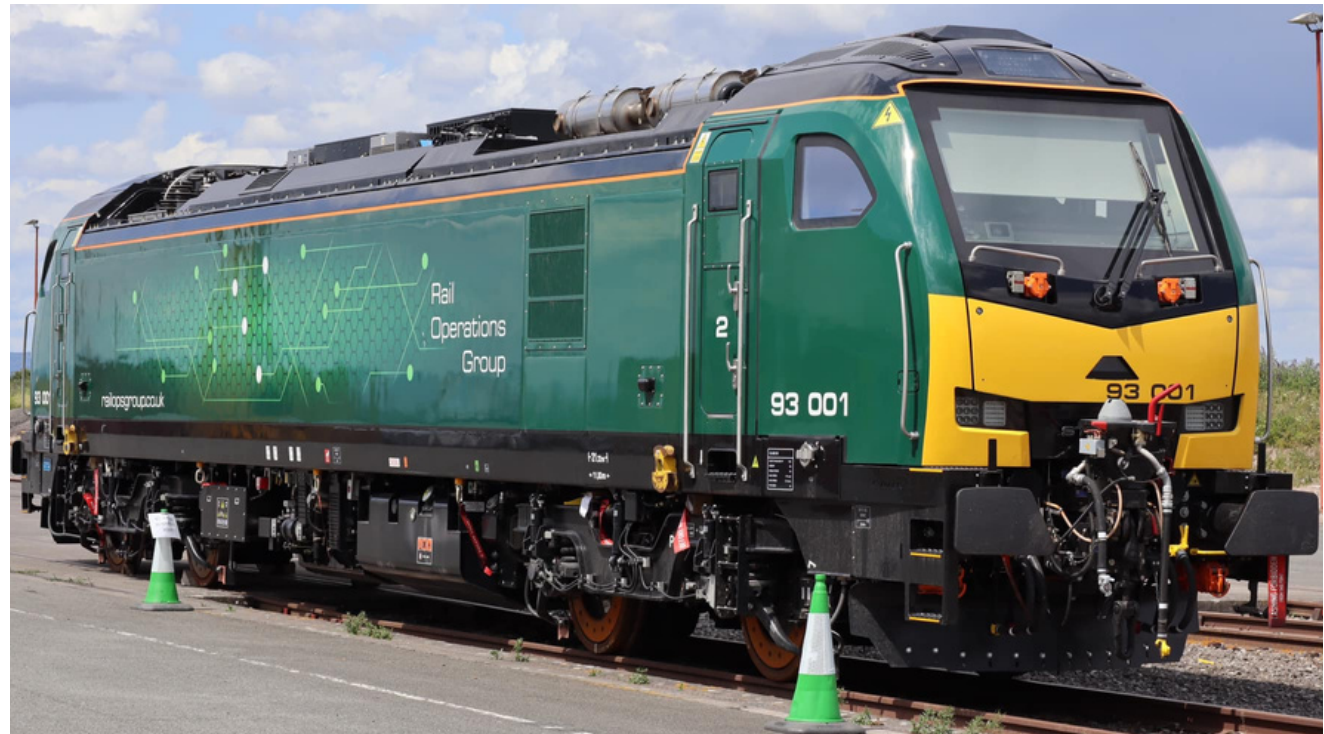
The Class 93 Tri-Mode locomotive at the railhead in Royal Portbury Dock. The locomotive was transported out by road to Leicestershire.

As the locomotive left Bristol Port, it drew the attention of ardent train spotters who eagerly awaited its departure. The locomotive's road journey to Leicestershire became a spectacle, attracting enthusiasts who sought to capture the momentous occasion on camera as it made its journey to North.