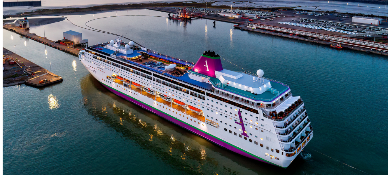
Main picture: Ambassador's Ambition setting sail from Royal Portbury Dock.