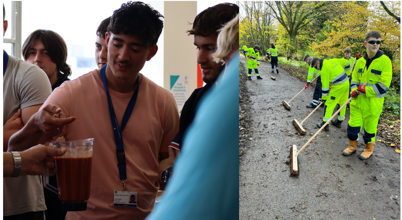
Apprentices above taking part in the cooking lesson and, pictured right, taking part in the Duke of Edinburgh Gold Scheme.

Bristol Port recognises the significance of equipping young apprentices with essential life skills beyond their primary area of expertise. By nurturing an understanding of healthy cooking practices and the financial advantages of home-cooked meals, the program seeks to empower the apprentices to make informed decisions for their personal and professional lives. In other news, 23 apprentices have now signed