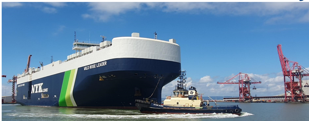
Wild Rose Leader in Royal Portbury Dock over the summer.

What sets the vessel apart is its utilisation of liquefied natural gas (LNG) as fuel. As NYK's fourth LNG-fuelled pure car and truck carrier, the vessel exemplifies a commitment to environmental responsibility, as LNG-powered vessels significantly reduce in dock emissions compared to traditional fuel options. Bristol Port proudly embraces this trend in sustainable shipping, recognising the importance of transitioning towards cleaner energy sources for the maritime sector. LNG contributes to improved air quality and aligns with the Port's green initiatives. Over the past year, following successful trials of hydrotreated vegetable oil (HVO), over 90,000 litres was consumed amongst the Port's larger plant, such as front-end loaders, and harbour vessels. By welcoming such eco-friendly vessels and plant, the Port reinforces its dedication to minimising the environmental impact of maritime operations.